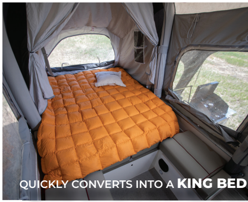
QUICKLY CONVERTS INTO A KING BED